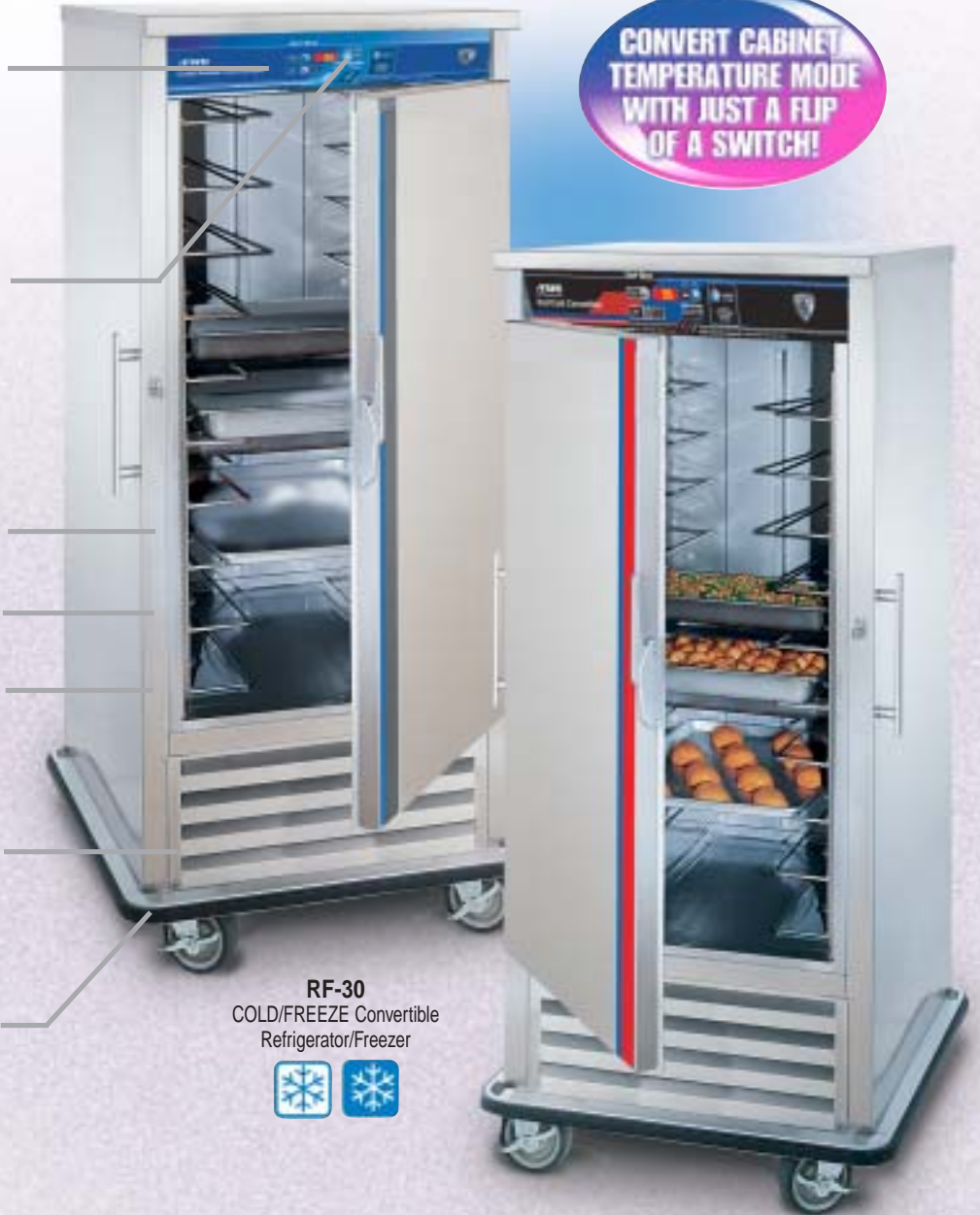
RF-30 COLD/FREEZE Convertible Refrigerator/Freezer

FWE heavy-duty construction features and design engineered to answer your most demanding needs, FWE's all stainless steel heavy welded construction delivers performance and dependability you can count on. Built on a special one-piece stainless steel tubular frame, reinforcing members, design engineered and constructed to absorb vibration, shocks, and prevent refrigeration leaks. High density ultra-guard insulation prevents temperature loss and assures efficiency.