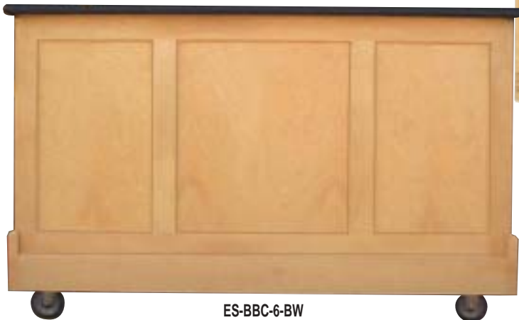
ES-BBC-6-BW Birch with a Natural Finish