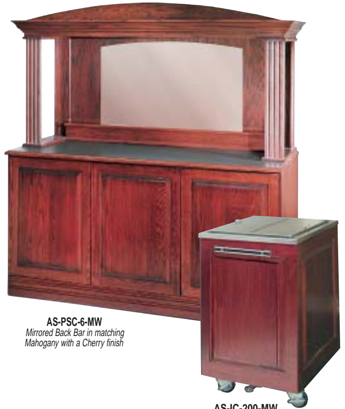
AS-PSC-6-MW Mirrored Back Bar in matching Mahogany with a Cherry finish