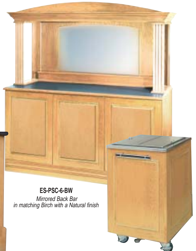
ES-PSC-6-BW Mirrored Back Bar in matching Birch with a Natural finish