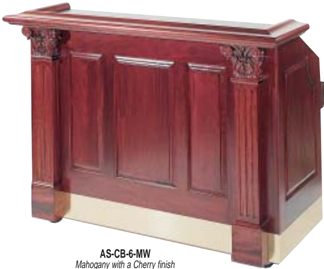
AS-CB-6-MW Mahogany with a Cherry finish