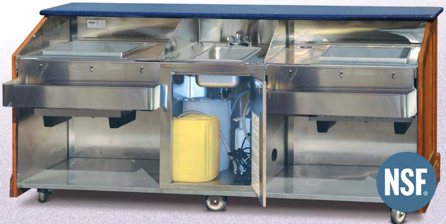
ES-BBC-8-TK Built-In Hand Washing System Located In Center Of Working Side