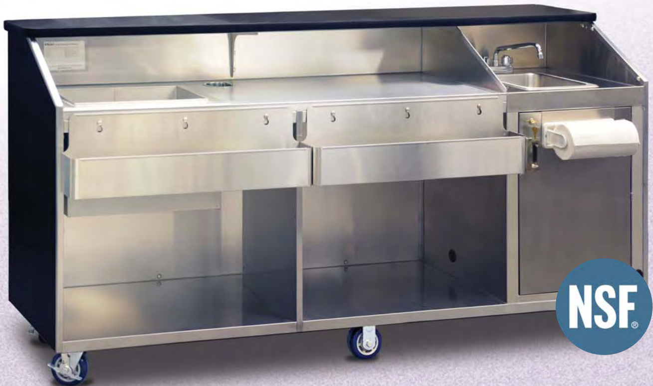
BBC-8 Built-In Hand Washing System Located On Right-Hand Working Side