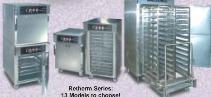
Retherm Series: 13 Models to choose!

Food Warming Equipment Co., Inc. 7900 South Route 31 Crystal Lake, IL 60014 USA 800-222-4393 • 815-459-7500 Fax: 815-459-7989 www.fweco.com e-mail: sales@fweco.com