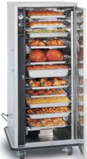
UHS-12 Universal Heated Server for 18" x 26" Trays and 12" x 20" pans