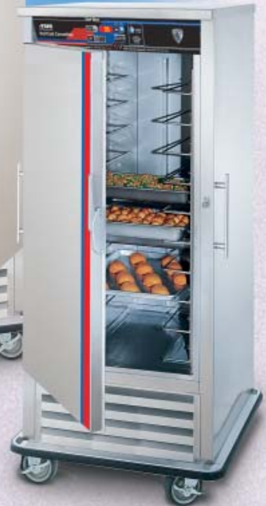
RF-30 COLD/FREEZE Convertible Refrigerator/Freezer

CONVERT CABINET TEMPERATURE MODE WITH JUST A FLIP OF A SWITCH!