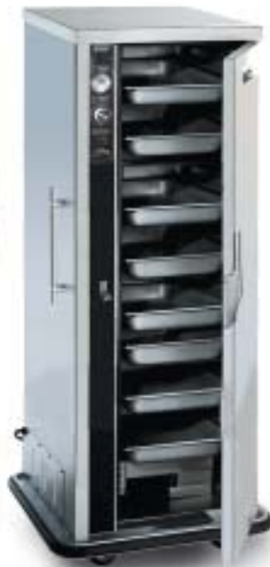
PS-1220-15 Pan Server for 12" x 20" pans