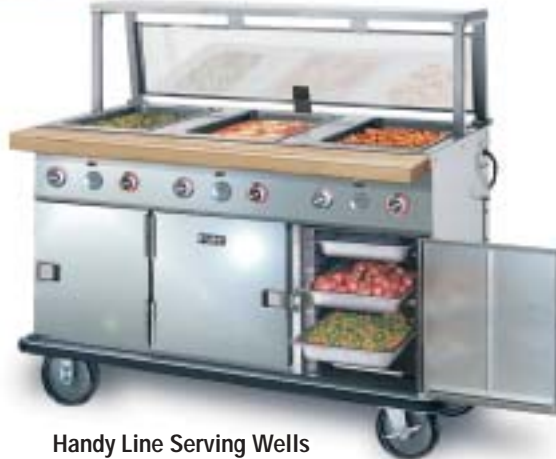
Handy Line Serving Wells with heated base compartments for 12" x 20" pans