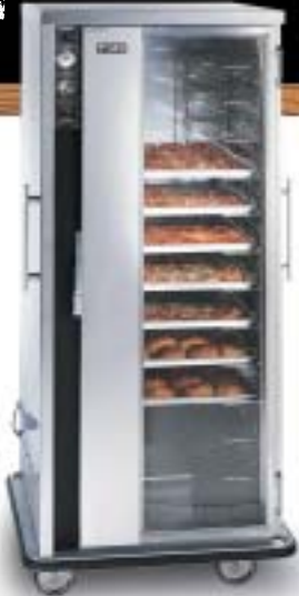
TS-1826-18 Tray Server for 18" x 26" Trays