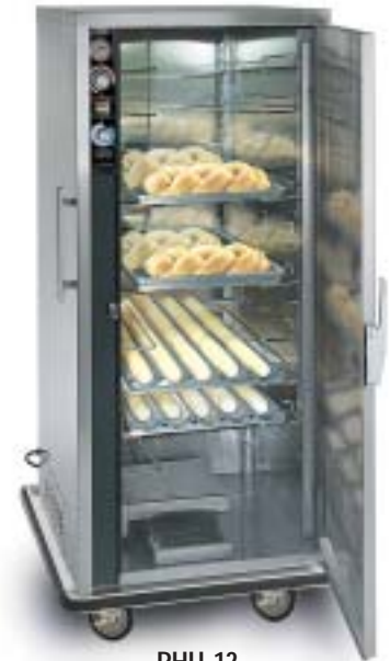
PHU-12 Mobile Proofer/Heater for 18" x 26" Trays and 12" x 20" pans