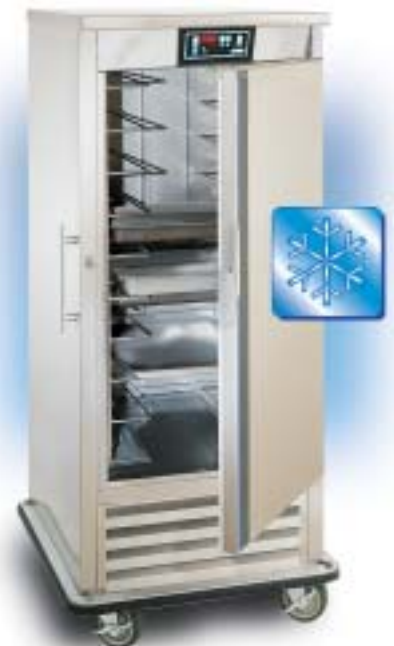
URS-10 Mobile Refrigerator for 18" x 26" Trays and 12" x 20" pans