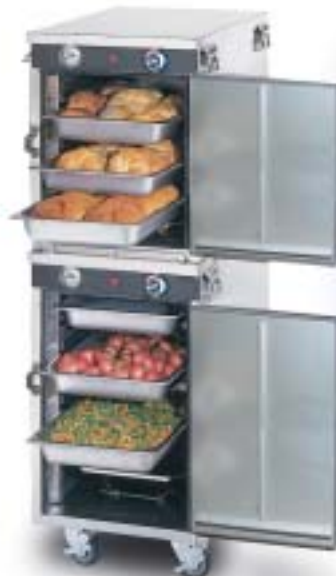
HLC5S stacked on HLC-8 Mix and Match Compartments for 12" x 20" pans