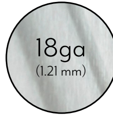
18 GAUGE STAINLESS STEEL EXTERIOR