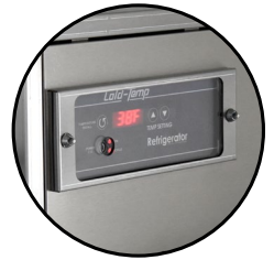
LEXAN VIEW CONTROL PANEL COVER (ACCESS TO POWER ONLY)