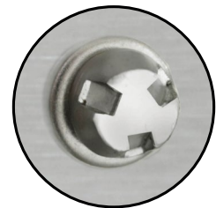
TAMPER-PROOF FASTENERS (INSIDE & OUTSIDE)