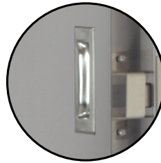
RECESSED HANDLE GRIPS