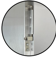
PADLOCKING TRANSPORT LATCH