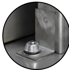
RACK HOLD DOWN DEVICE

INCLUDES LEVEL 1 & 2 FEATURES PLUS THE FOLLOWING UPGRADES