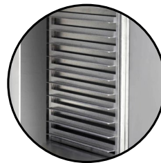
ONE PIECE RACK ASSEMBLY (SPECIFY SPACINGS)