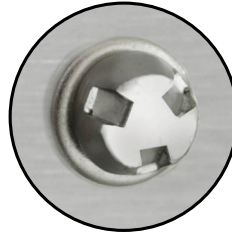
TAMPER-PROOF FASTENERS (OUTSIDE ONLY)