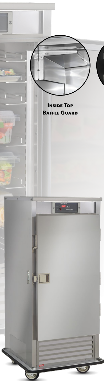
URS-10 HDM Level 2