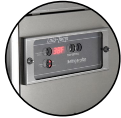
LEXAN VIEW CONTROL PANEL COVER (ACCESS TO CONTROLS)