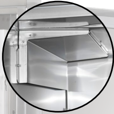
INSIDE TOP BAFFLE GUARD