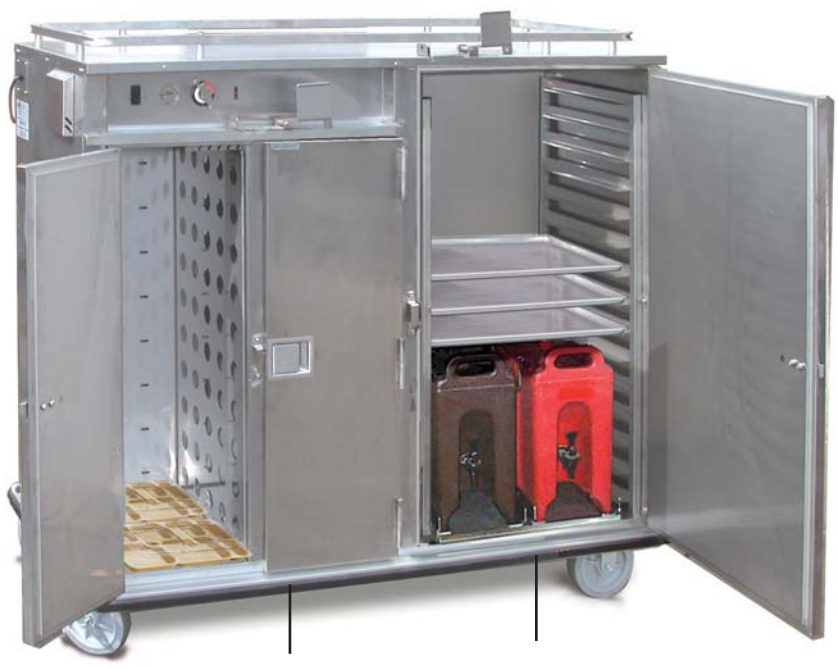
Heated Compartment Ambient Compartment PTST-141064H-182615A