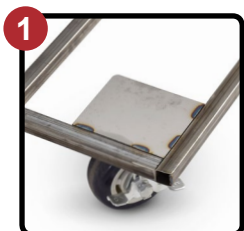
Tubular Welded Base Frame