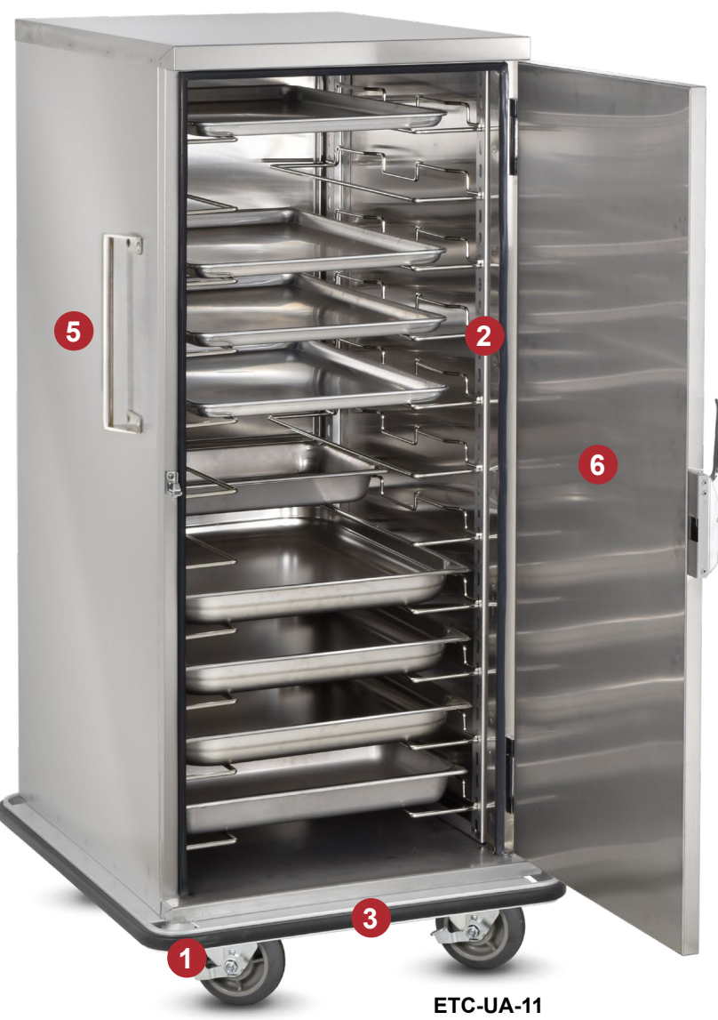
(Shown with Optional Accessory Quiet Ride Casters)