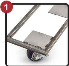
Built for Transport