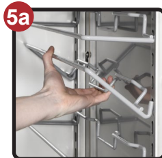
Adjustable Tray Slides