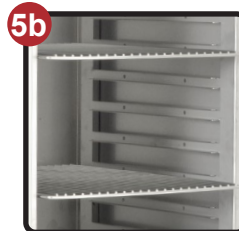
GN Fixed Rack