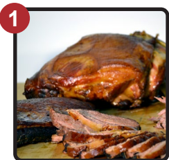
Reduce Shrinkage, Natural Browning