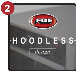
Designed To Not Require A Hood