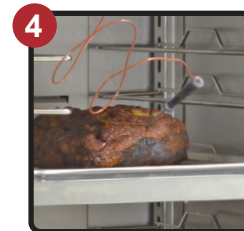
Cook and Hold