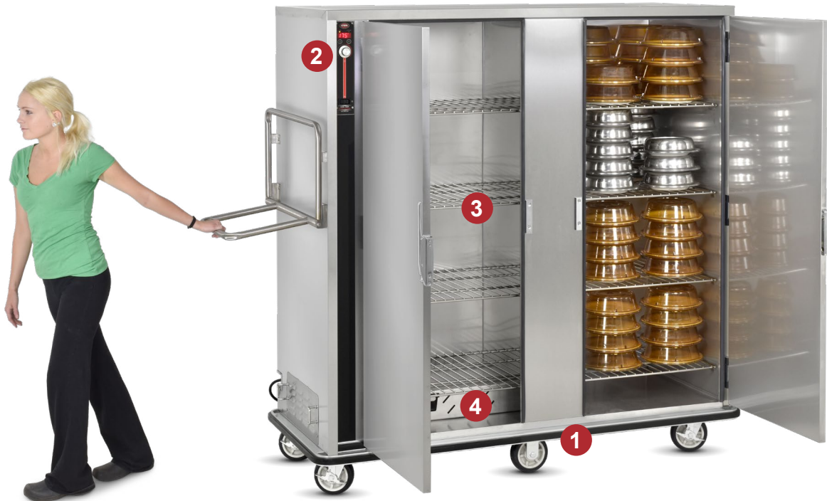
(Model shown with ergo U-shaped handle with drop down tubular stainless steel handle combination, and cord winder bracket optional accessories)