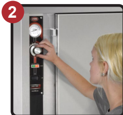
Eye Level Control Panel