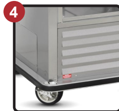
Bottom Mounted Compressor