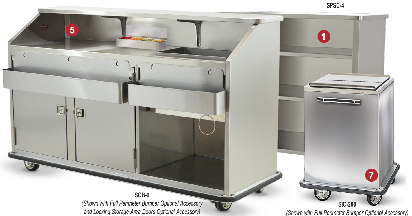
SCB-6 (Shown with Full Perimeter Bumper Optional Accessory and Locking Storage Area Doors Optional Accessory)