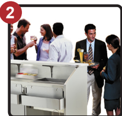
Perfect For Event Hosting