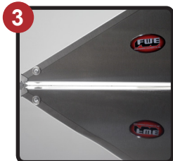
Stainless Steel Construction