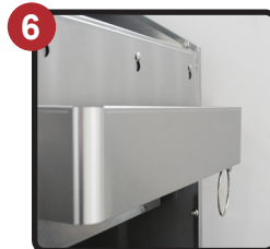
Removable Speed Rail