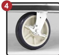
Large EZ Roll Casters