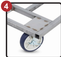
Tubular Welded Base Frame