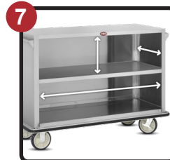
Custom Sizing and Spacing Available