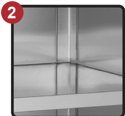
Heavy-Duty Welded Stainless Steel Construction