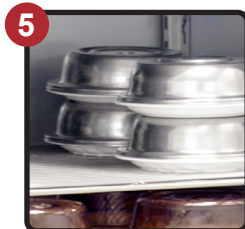
Heavy Duty "No Sag" Shelves