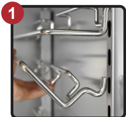
Adjustable Tray Slides