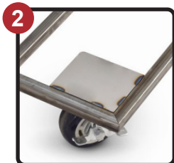
Tubular Welded Base Frame