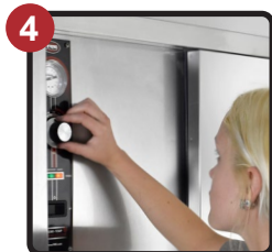
Eye-Level Control Panel