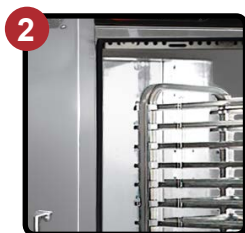
Fits Any Full Size Combi Rack