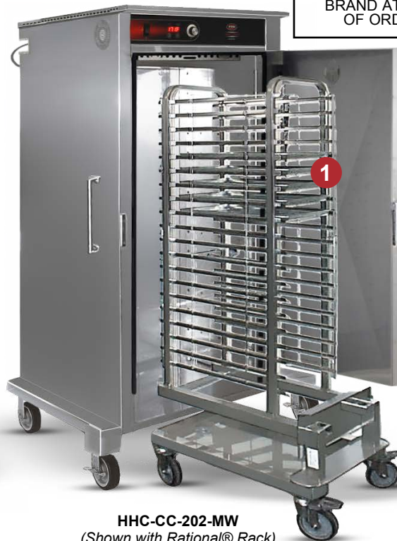
HHC-CC-202-MW (Shown with Rational® Rack)