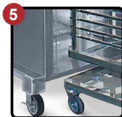
Open Bottom Base