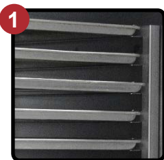
Versatile Fixed Rack

(Bottom Compartment Shown with Adjustable Tray Slide Optional Accessory)