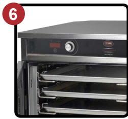
User Friendly Electronic Controls