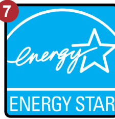
Energy Star Approved