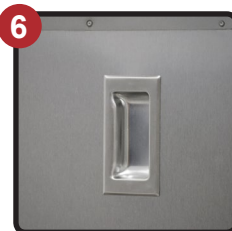
Stainless Steel Construction