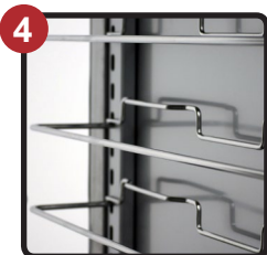
Adjustable Tray Slides