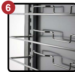
Adjustable Tray Slides