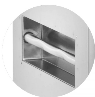
Recessed Push-Pull Handles