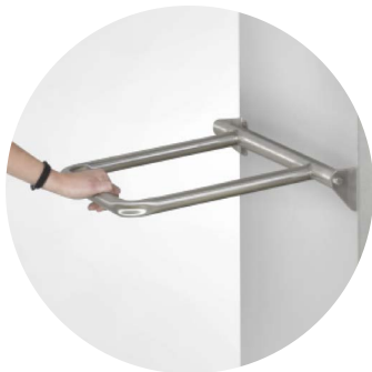
Drop-Down Tubular Stainless Steel Handle