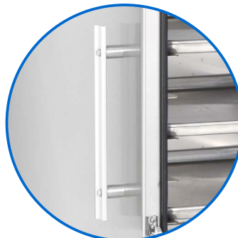
Push-Pull Handles TYPICALLY USED ON HDM LEVEL 1