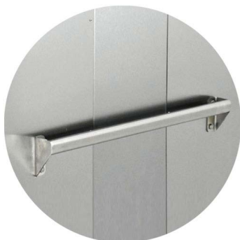
Rear Mounted Tubular Handle