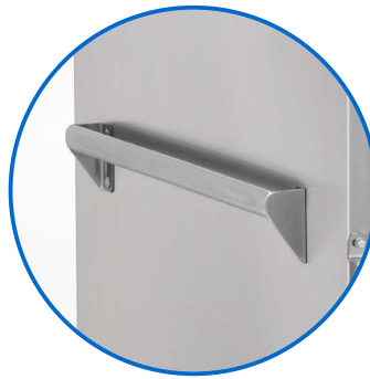
Tubular Stainless Steel Handles TYPICALLY USED ON HDM LEVELS 2 & 3