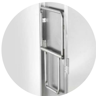
Ergo U-Shaped Handle & Drop-Down Handle Combo