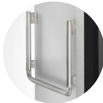
Ergo U-Shaped Handle