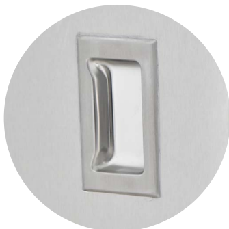
Recessed Hand Grips