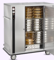
Plate Holding Perfection