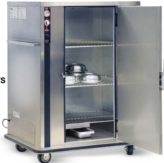
HEATED HOLDING BANQUET CABINETS WITH SHELVES