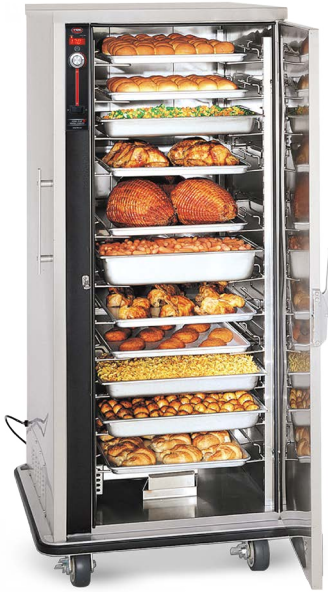
HEATED HOLDING CABINETS WITH ADJUSTABLE TRAY SLIDES