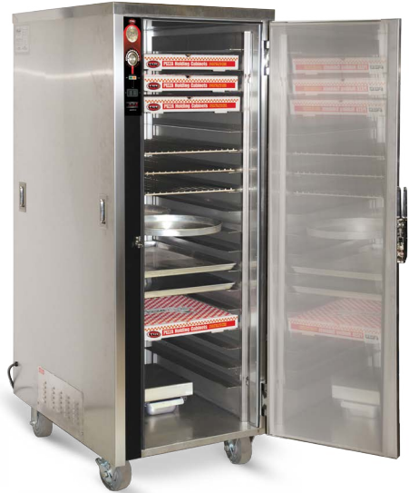
HEATED HOLDING PIZZA CABINETS FOR BOXES, TRAYS, SHELVES, AND PANS