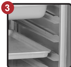
Fixed Rack Assembly