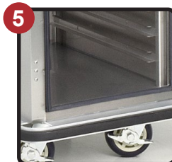
Open Bottom Base