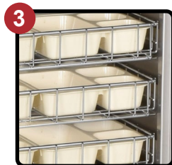
18" x 26" Baskets