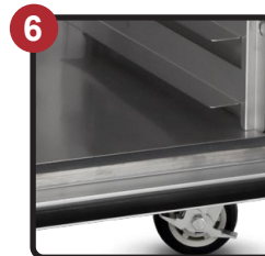
Open Bottom Base