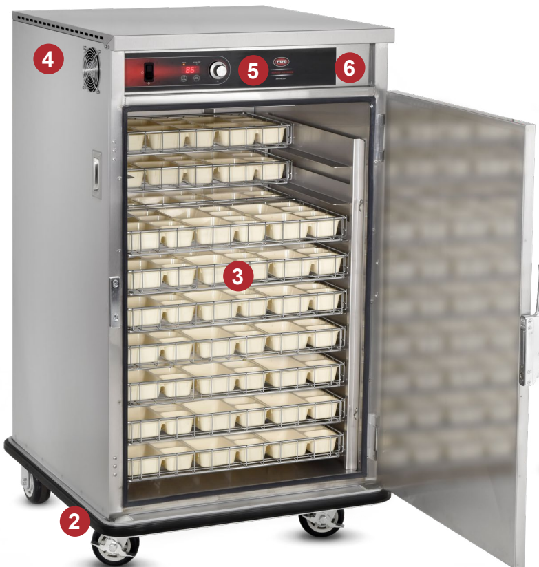
(Shown with Optional Accessory Wire Baskets)