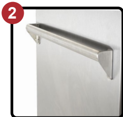
Rear Tubular Push Handle

Improve your operation today! See Specification page 07-03000, RH-B series, for high volume basket rethermalization ovens from FWE.