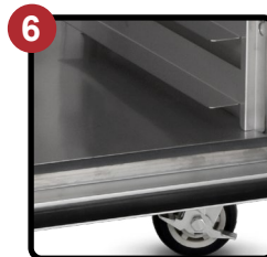
Open Bottom Base