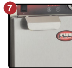
Work Flow Handle