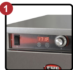
Individual Heat Controls