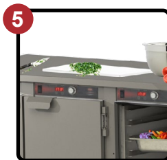
Stainless Steel Work Top