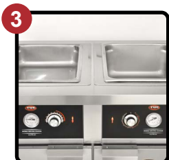
Separately Controlled Wells