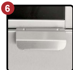
Work Flow Handle