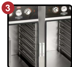
Separately Controlled Compartments