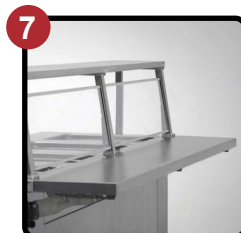
Optional Sneeze Guard & Tray Slide Shelf