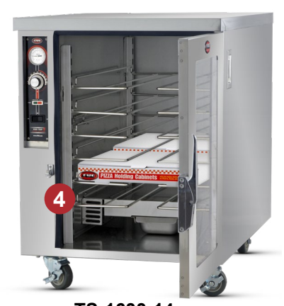
TS-1633-14 (Shown with Optional Accessories Full See-Thru Lexan Door, Edgemount Door Latch and Adjustable Tray Slides)