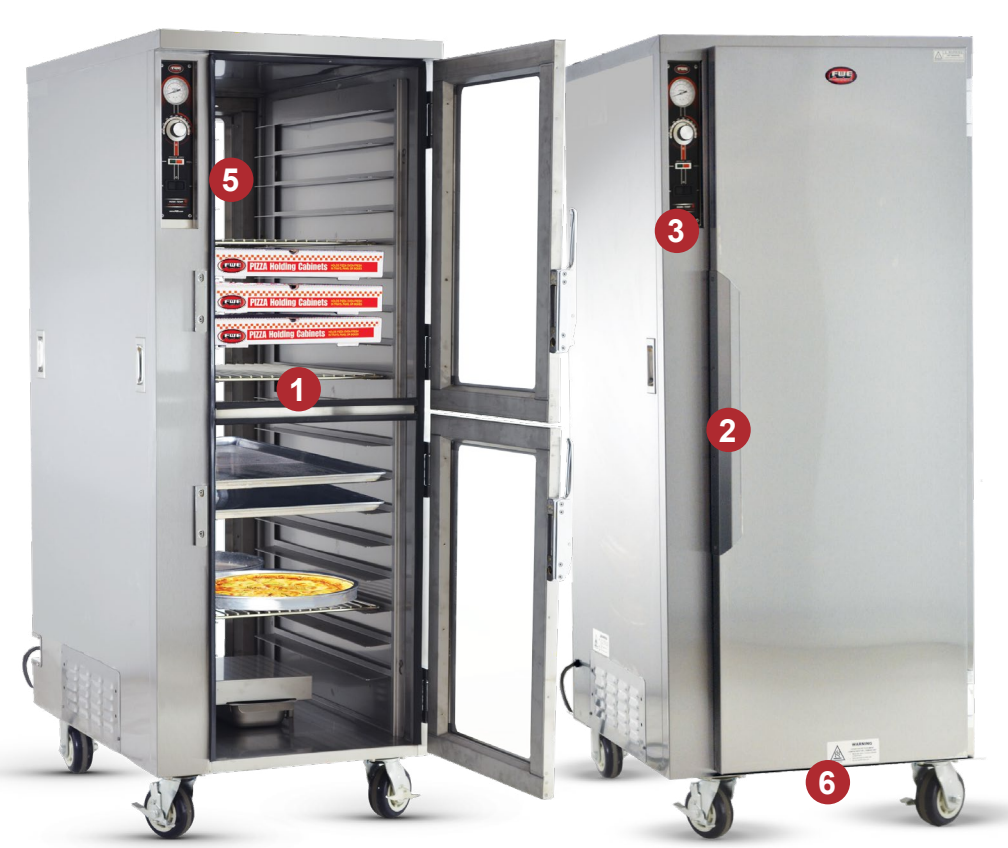
TS-1633-36P (Shown with Optional Accessories Dutch See-thru Lexan Doors and Magnetic Door Latch)