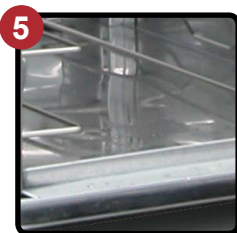
Open Bottom Base