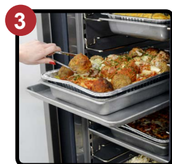
Adjustable Tray Slides