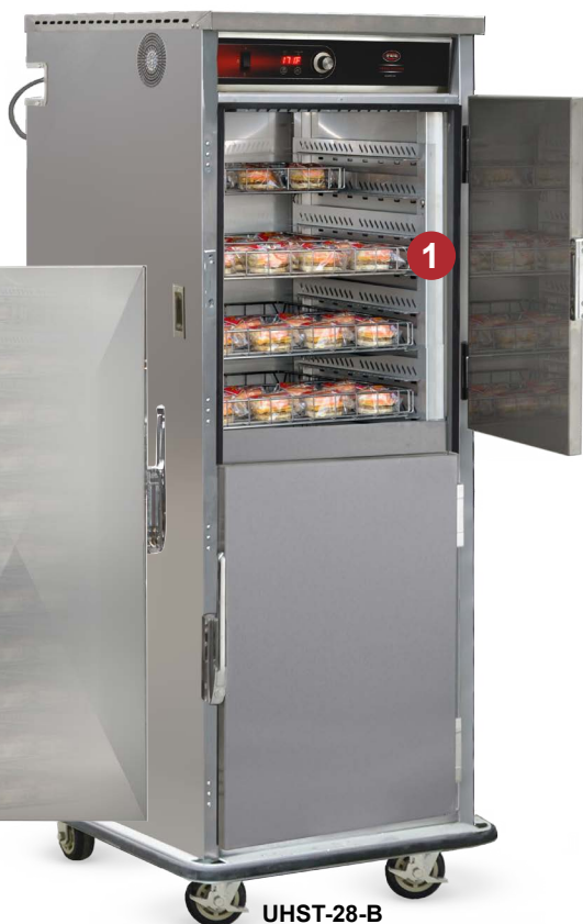
UHST-28-B (Shown with Dutch Door and Wire Baskets Optional Accessories)