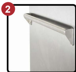
Rear Tubular Handle for Transport