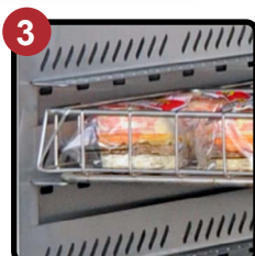
18" x 26" Baskets