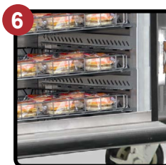
Open Bottom Base