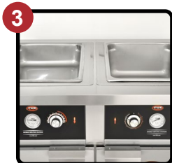
Separately Controlled Wells

(Shown With Optional Accessories Sneeze Guard and Tray Slide Shelf)