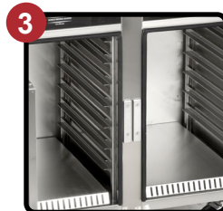
Separately Controlled Compartments