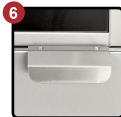
Work Flow Handle