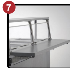
Optional Sneeze Guard & Tray Slide Shelf