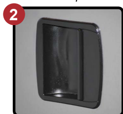
Antimicrobial Door Handle