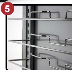
Adjustable Tray Slides