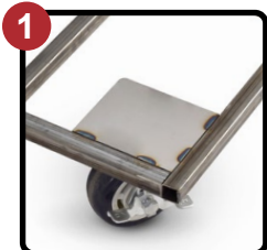
Tubular Welded Base Frame