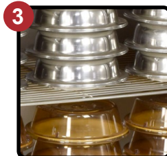
Heavy-Duty "No Sag" Shelves