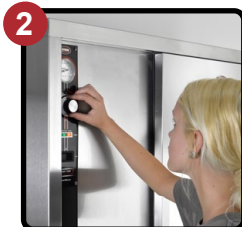
Eye Level Control Panel