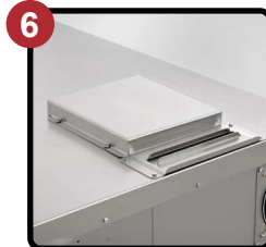
Automatic Venting Baffle