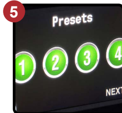
8 Programmable Presets