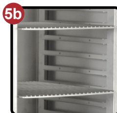
GN Fixed Rack