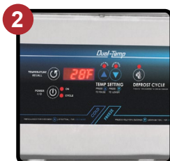
Dual-Temp Control Panel