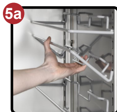
Adjustable Tray Slides