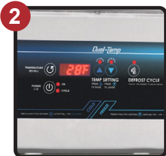
Dual-Temp Control Panel