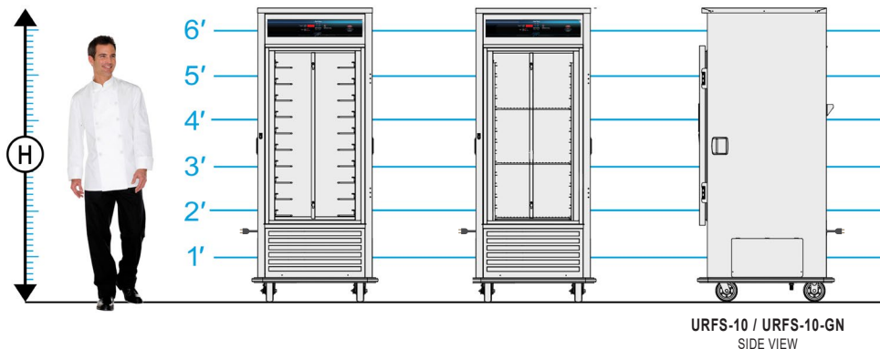
URFS-10 / URFS-10-GN SIDE VIEW