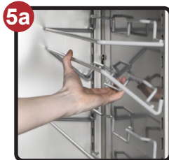
Adjustable Tray Slides