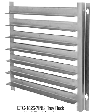
ETC-1826-7INS Tray Rack with 3" Fixed Spacings (One side of a pair)

FWE's all stainless steel transport is built tough for all purpose transport and storage. Fully insulated for hot or cold transport.