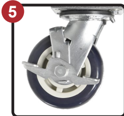
Built for Transport