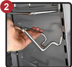
Adjustable Tray Slides