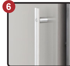
Push Pull Handles