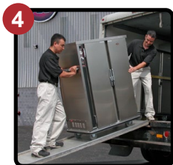
Built for Transport