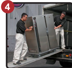
Built for Transport