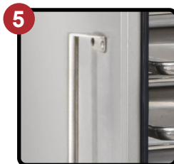
Tubular Push Pull Handles