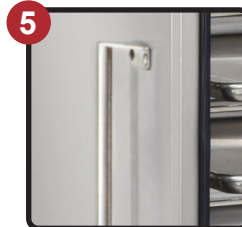
Tubular Push Pull Handles