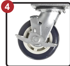
Built for Transport