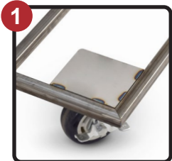
Tubular Welded Base Frame