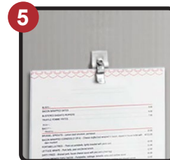
Menu Card Holder