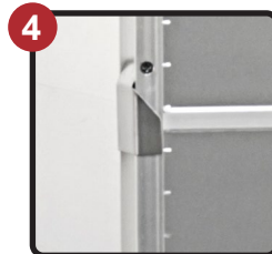
Gravity Door Latch