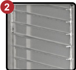
Fixed Tray Slides