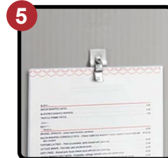
Menu Card Holder