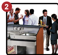
Perfect For Event Hosting