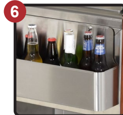
6 Removable Bottle Speed Rail