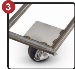
Tubular Welded Base Frame