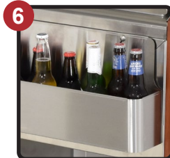
Removable Bottle Speed Rail