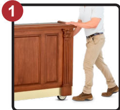
Made for Mobile Applications