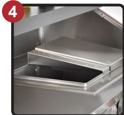
60lb Ice Bin with Drain