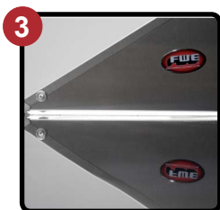
Stainless Steel Construction