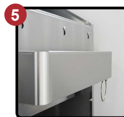
Removable Speed Rail