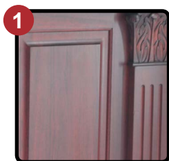
Solid Mahogany Wood