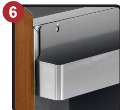
Removable Bottle Speed Rail