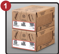
Designed for Bag-in-Box

Scan QR code for BBC bars with built-in hand sinks. Scans to s12-02500-bbc-hs