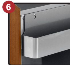
Removable Bottle Speed Rail