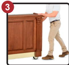
Made for Mobile Applications