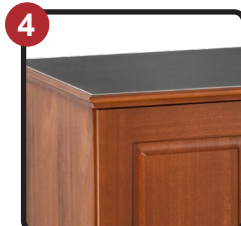
Easy to Clean Surfaces