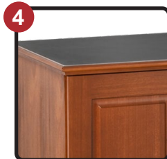
Easy to Clean Surfaces