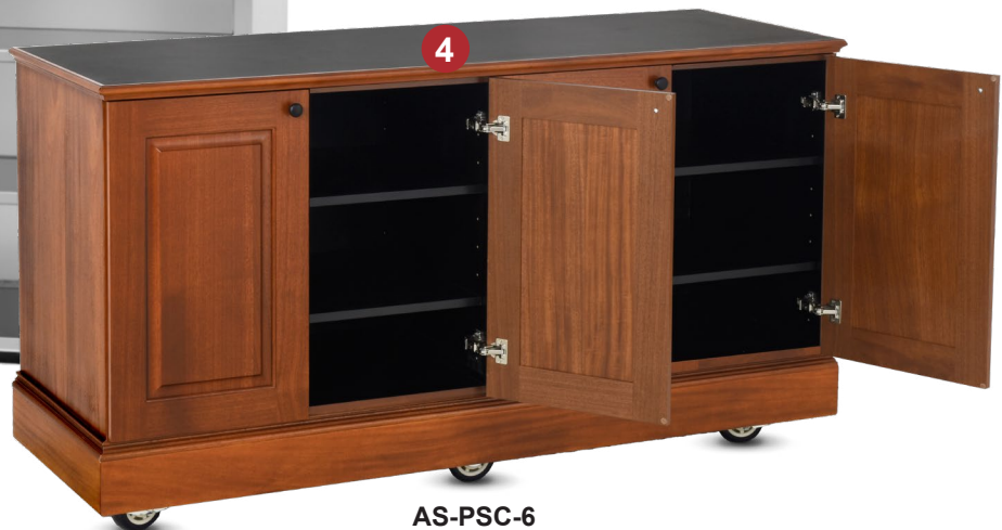
AS-PSC-6 ARCHITECTURAL SERIES (MAHOAGANY WOOD)

Shown with Optional Accessory Full Perimeter Bumper