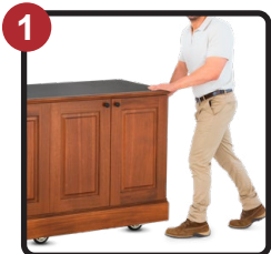
Made for Mobile Applications