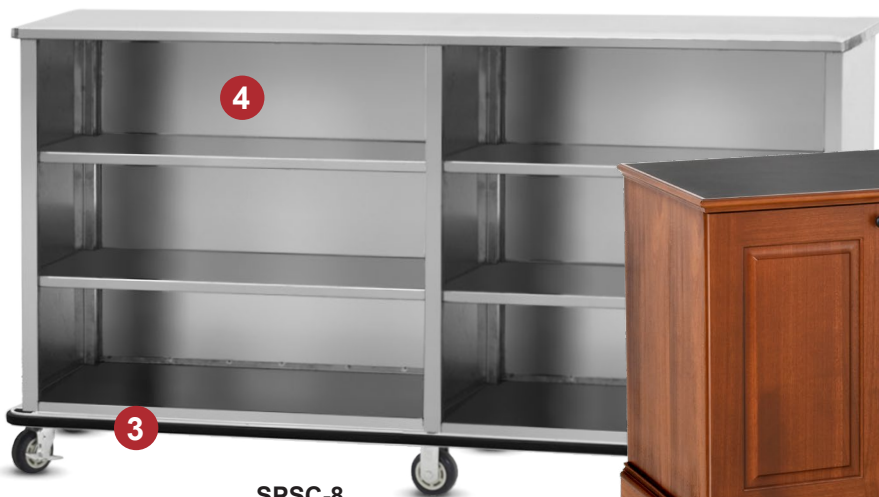
SPSC-8 WEATHER-ALL SERIES (STAINLESS STEEL)

Shown with Optional Accessory Full Perimeter Bumper