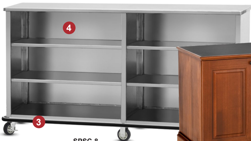
SPSC-8 WEATHER-ALL SERIES (STAINLESS STEEL)

Shown with Optional Accessory Full Perimeter Bumper