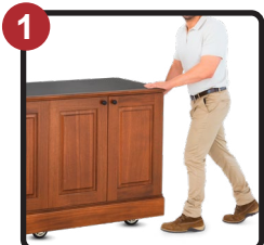
Made for Mobile Applications