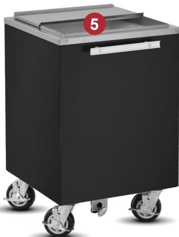
IC-200 PROFESSIONAL SERIES (LAMINATE) MATTE BLACK FINISH