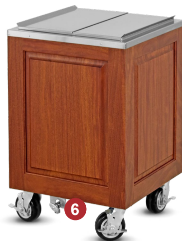
AS-IC-200 ARCHITECTURAL SERIES (MAHOGANY WOOD) CHERRY FINISH