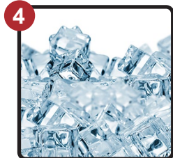
200lb Insulated Ice Storage