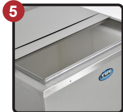
Stainless Steel Sliding Cover