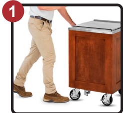
Made for Mobile Applications