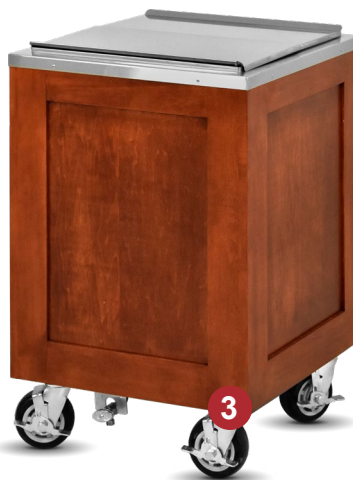
ES-IC-200 EXECUTIVE SERIES (MAPLE WOOD) CHERRY FINISH