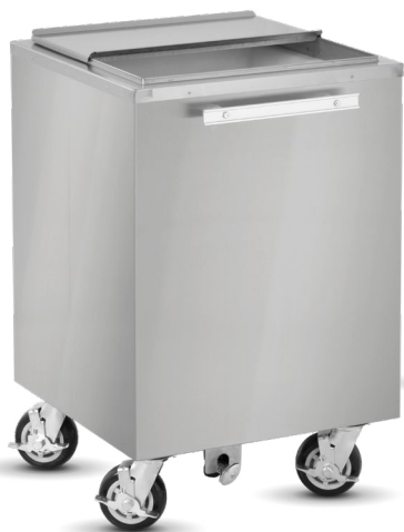
SIC-200 WEATHER-ALL SERIES (STAINLESS STEEL)