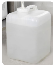
5 Gallon Fresh Water Tank