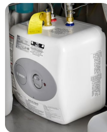
2.7 Gallon Water Heater