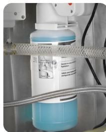
Soap Cartridge and Battery