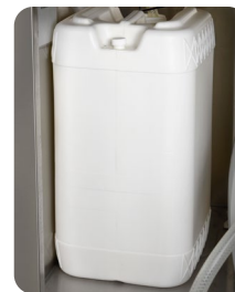
7.5 Gallon Wastewater Tank