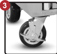
Built for Transport