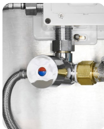
Faucet Temperature Control