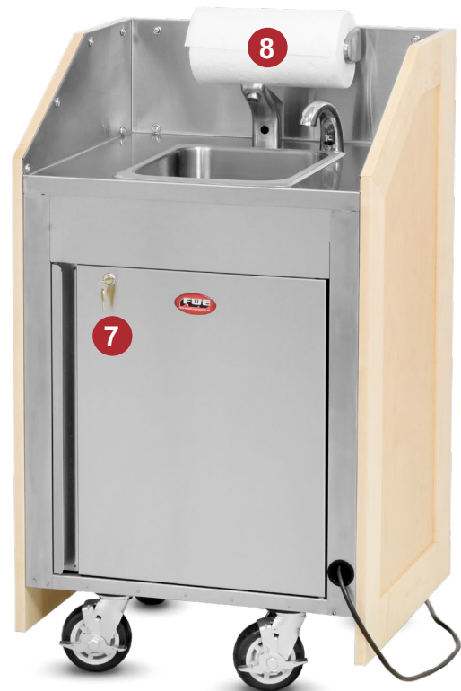
EXECUTIVE SERIES (MAPLE WOOD) NATURAL FINISH