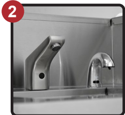
Touchless Faucet & Soap Dispenser