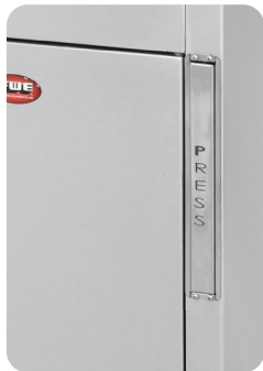
Knee Activated Faucet