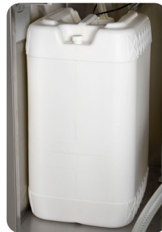
7.5 Gallon Waste Water Tank