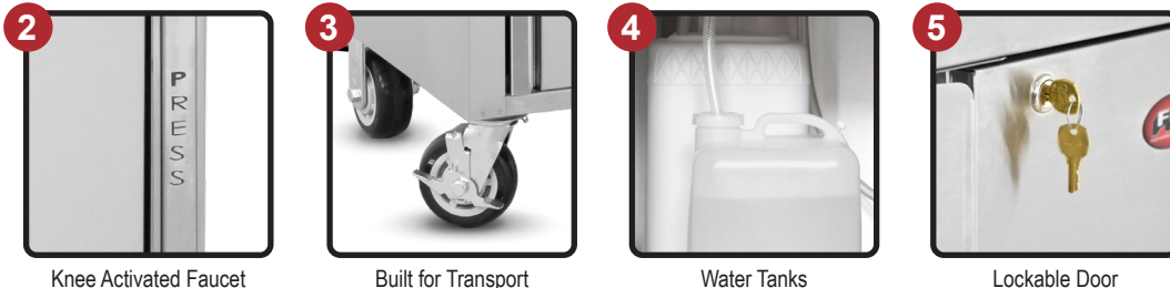
Knee Activated Faucet