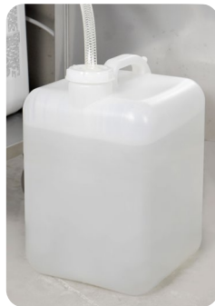
5 Gallon Fresh Water Tank