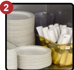
Open Base for Storage