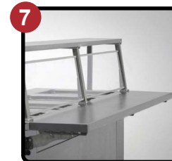
Optional Sneeze Guard & Tray Shelf