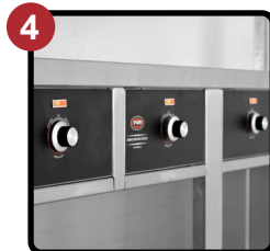
Independently Controlled Wells