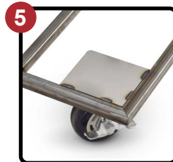
Built for Transport