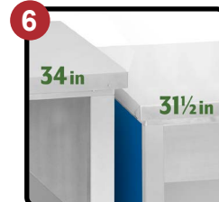
Standard or Elementary Height Available