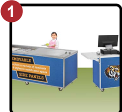
Matching Speed Lines Available