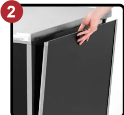
Removable Side Panels