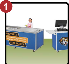
Matching Speed Lines Available